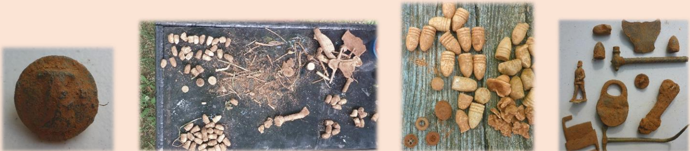
Above are pictures of natural finds from the 2020 hunt.

We will have thousands of dollars’ worth of relics seeded (or by token) on the property, plus the opportunity to find natural relics. This one-day hunt is a great opportunity to hone your metal detecting skills. Even though the ground is highly mineralized, seeded relics and tokens will not be deep so most metal detectors will be fine. On the 2020 hunt over 200 natural bullets and at least one Confederate button left from the civil war was found. The prize tokens will be scattered in two fields only for a chance at some higher quality genuine civil war relics, civil war reference books, and more. Prizes will be won using a double-blind method. All prizes will be given away.